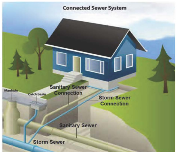
Sewer connection from the home to the sewer main

Sewer and storm connections are the joint responsibility of the City of Thunder Bay and the property owner. The City is responsible for the portion of the connection on City property, from the main to the property line. The property owner is responsible for the connection from the property line to the house. According to the Ontario Building Code, sewer and storm connections are required to have a front cleanout. Front cleanouts are generally located in the basement floor within 3 metres of the front wall of the building sealed with a threaded cap. Front cleanouts allow access to the connection for inspection and maintenance while also lowering the risk of equipment getting stuck in the connection.